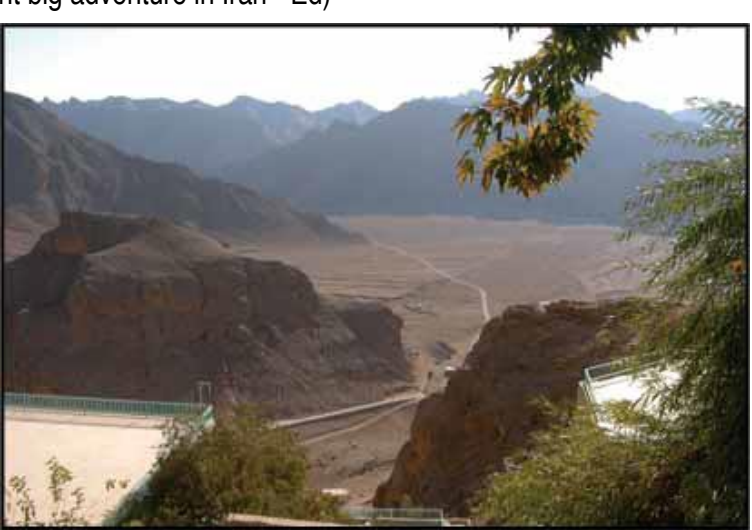
View from ChakChak shrine