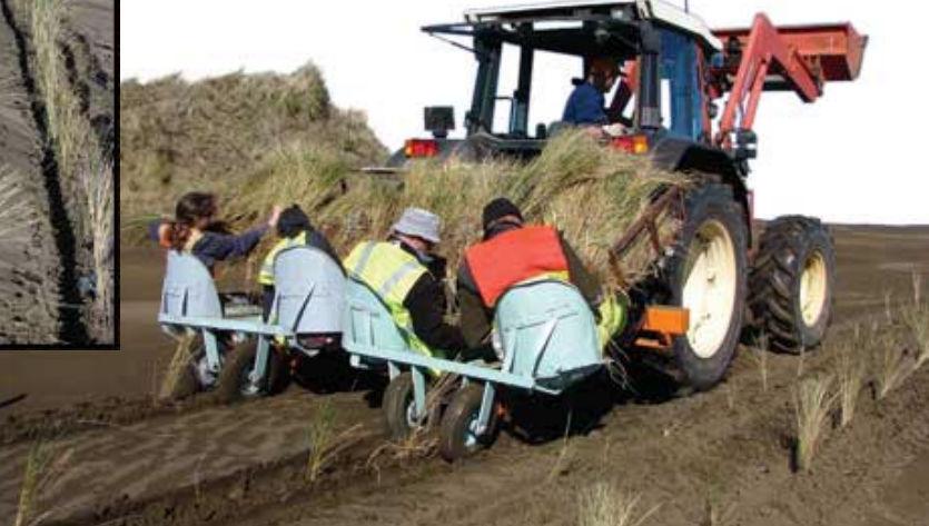
Takes the back-break out of Marram planting.