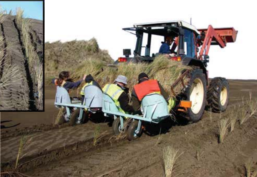
Takes the back-break out of Marram planting.