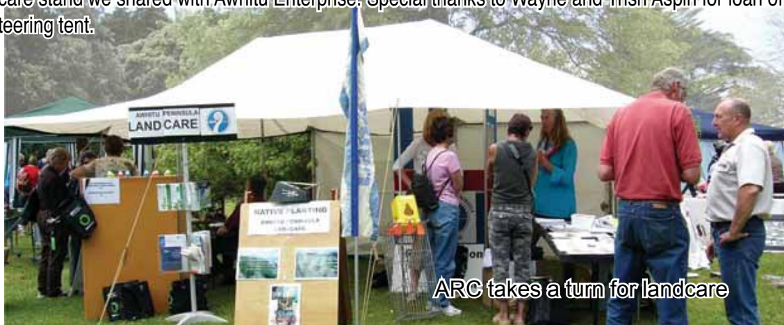
ARC takes a turn for landcare