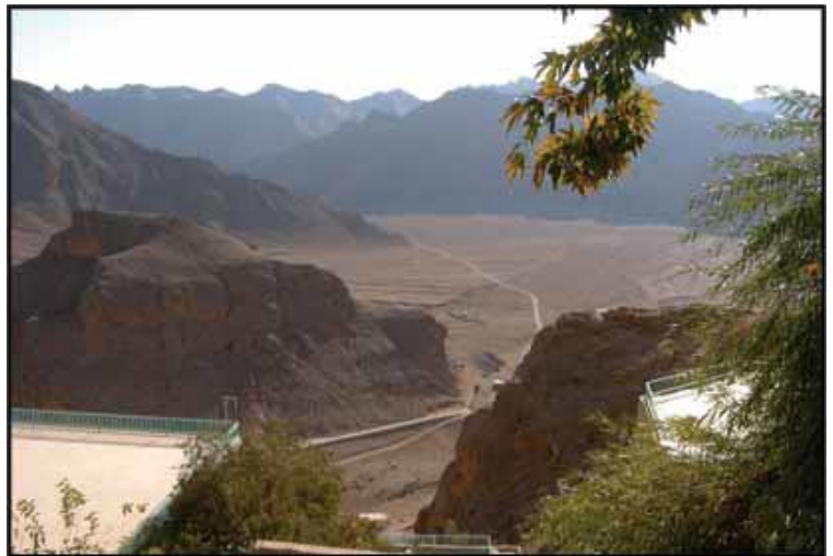
View from ChakChak shrine