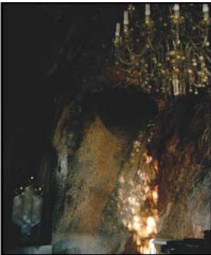
Eco Bulbed chandelier ChakChak cave

The whole world it seems has suddenly turned on to long life eco bulbs and yet no plan has yet been launched to deal with the high levels of mercury they contain; sure to become problem when they start ending their projected life of 7 years minimum. It's something to think about whenever you break an eco bulb between now and then.